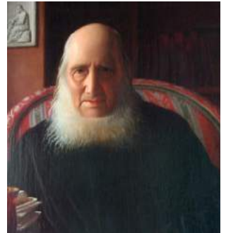
N.F.S. Grundtvig was a Danish pastor, author, poet, philosopher, historian, teacher, and politician whose teachings influenced the folk school movement in Denmark and throughout the world.

Architecturally, a new elevator, new restrooms, automated doors, and a nursery will assist in accessibility and safety concerns that our previous wing couldn't accommodate. The focal point for the wing is the atrium, which will be a gathering space before and after worship, a hangout space for college students, and an open area for the community to engage the congregation. Much to the delight of many in the congregation, the atrium will allow natural sunlight to once again shine through the historic stained-glass windows on the eastern side of the sanctuary.